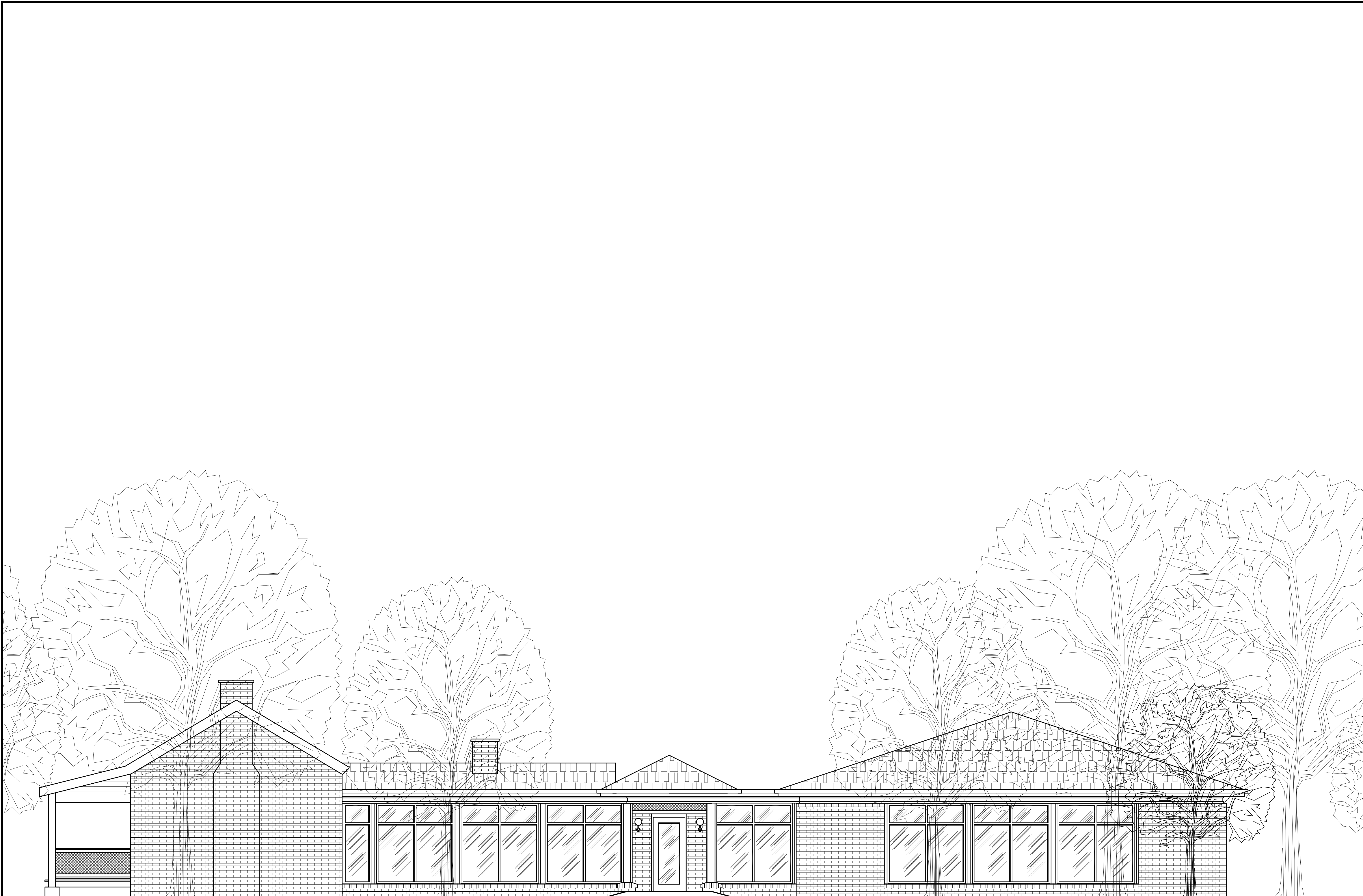
SOUTH ELEVATION W/ CANOPY SCALE: 1/4" = 1'-0"